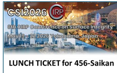
Appearance of lunch ticket