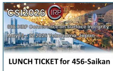
Appearance of lunch ticket