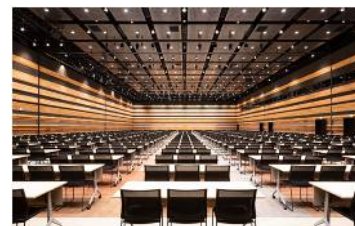
Nara Prefectural Convention Center